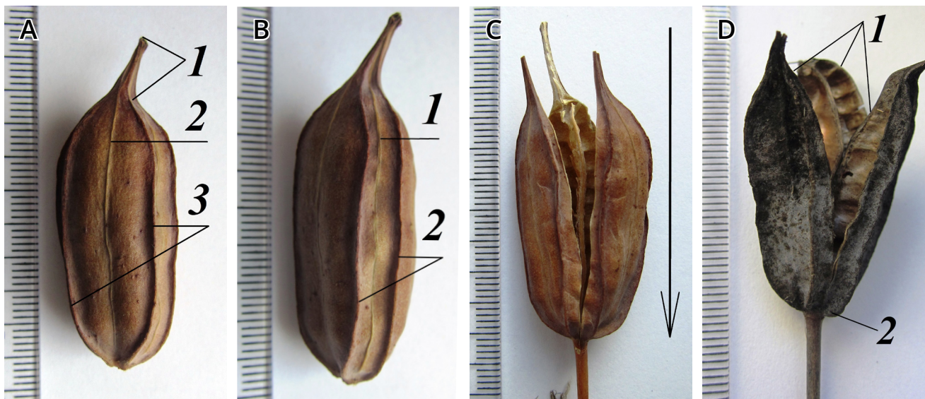
Figure 2. Morphological peculiarities of Iris halophila capsules: A – apical spout (1), commissural suture (2), ribs (3); B – carinal groove (1) and ribs (2); C – degree, and direction of the dehiscence (arrow); D – upper parts of the valves (1) and fruit base (2).