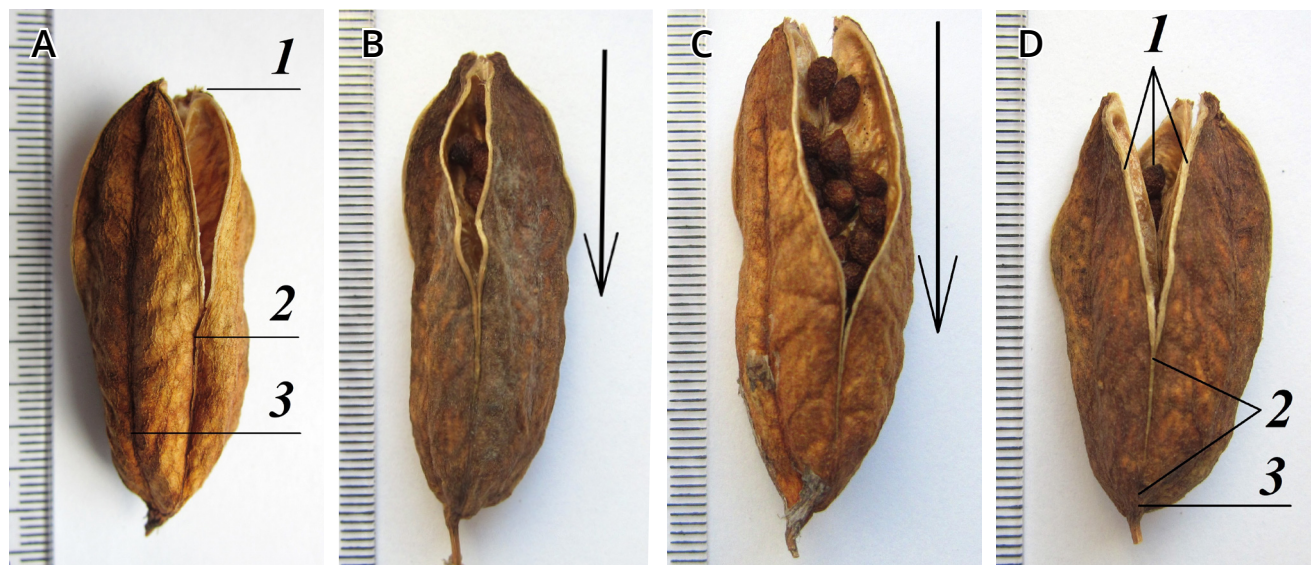
Figure 4. Morphological peculiarities of Iris hungarica capsules: A – upper part of the capsule (1), carinal groove (2), and commissural suture (3); B, C – degree, and direction of the dehiscence (arrow); D – upper (1) and lower (2) parts of the valves, and fruit base (3).

the valves exceeds the width in 1.5–2 times. The shape of unripe and almost ripe capsules is indistinctly trihedral (Fig. 1 B; Fig. 3 C). After opening and exsiccation, the capsules become slightly deformed (Fig. 3 A, B, D). The upper part of the capsule : elongated into the apical spout, which is short (0.4–0.5 cm), thick, awl-shaped (Fig. 3 A). Surface : wrinkled, wrinkles oriented from the commissural suture (Fig. 3 A) obliquely upwards to the carinal suture (Fig. 3 A). All sutures are well pronounced, protruding (Fig. 3 A–D). The capsule surface is without ribs. Peduncle : very short (0.2–0.3 cm; Fig. 1 B; Fig. 3 C).