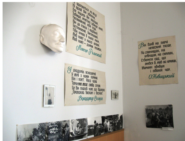
Figure 4. Design of the wall above the showcase dedicated to the first post-war director M.M. Gryshko.