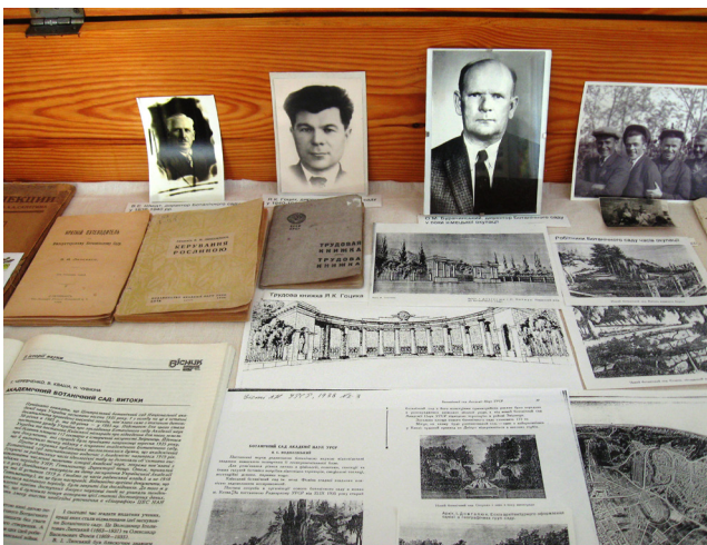
Figure 3. Showcase presenting materials from the period 1935–1944.