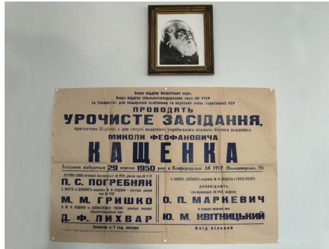
Figure 2. Design of the wall above the showcase dedicated to M.F. Kaschenko's Acclimatization Garden.