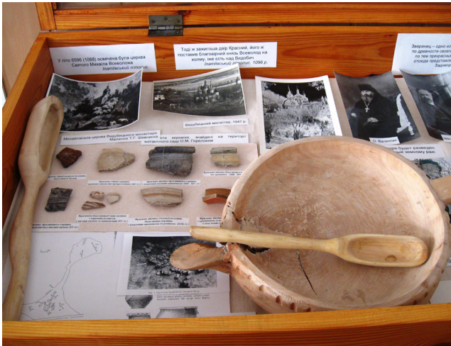
Figure 1. Showcase dedicated to the history of the NBG territory, featuring archaeological materials.