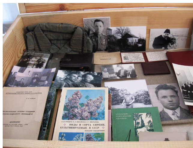
Figure 6. Showcase dedicated to the eminent landscape architect L.I. Rubtsov.