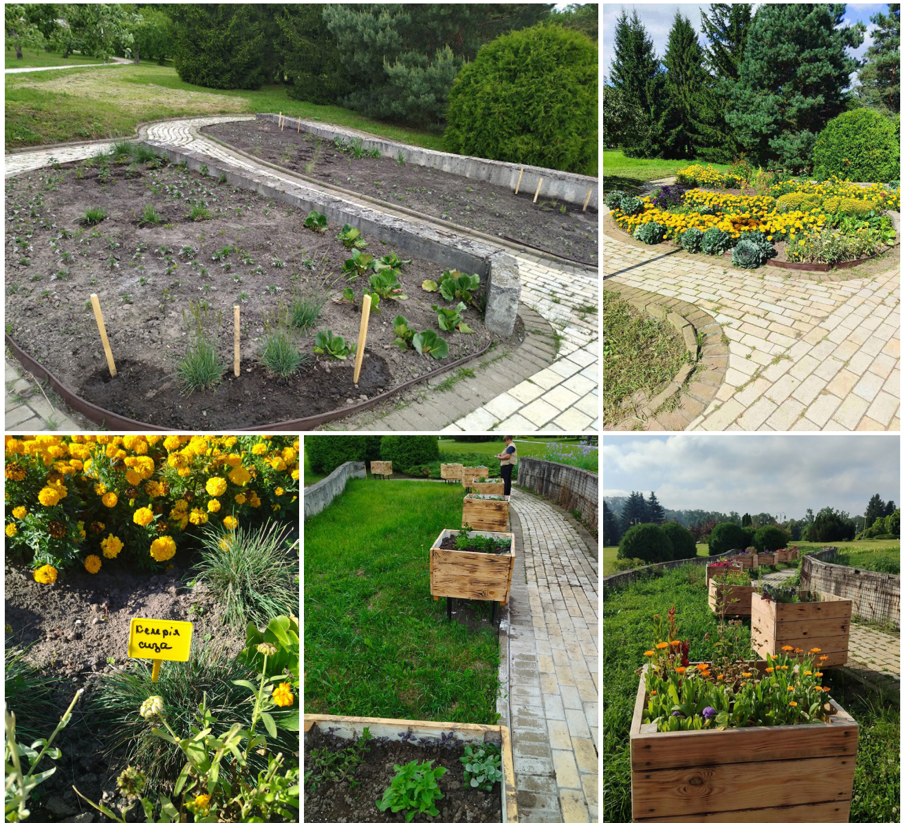
Figure 2. Results of the first stage of project implementation in the Park “Feofaniya”.

varieties of Lavandula angustifolia Mill., varieties of Hyssopus officinalis L., Digitalis grandiflora Mill., and Physalis alkekengi L. To further diversify and enhance the decorativeness, part of the plant composition will be changed annually with the addition of annual ornamental plants, such as varieties of Tropaeolum majus L. and Matthiola incana (L.) W.T. Aiton, and the genus Tagetes L. Over time, the assortment of this changing component may be supplemented and improved.