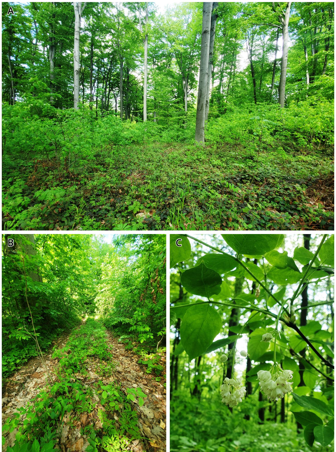
Figure 2. Staphylea pinnata on Mt. Radych. A – General view of the habitat; B – young plants are seen growing directly on the path; C – inflorescence.